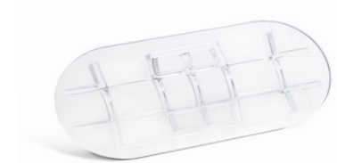
Asset Tag Mounting Bracket