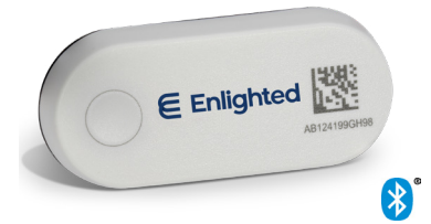
Enlighted Asset Tag